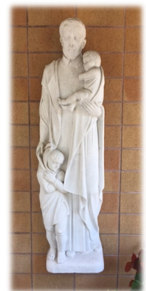
St. Vincent de Paul

We are a faith-filled Catholic school that promotes academic achievement and spiritual development for our students and families. This is reflected through worship, learning, support of each other, and service to the community.